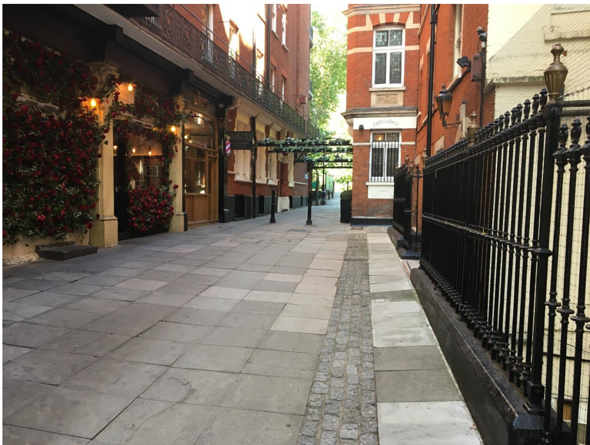
View of passageway, with resturant to the left side of photograph